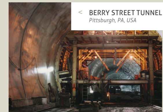
< BERRY STREET TUNNEL Pittsburgh, PA, USA

PITTSBURGH'S BERRY STREET TUNNEL was built in 1865 as a four-metre-wide, single-track rail tunnel. In 1873, it was widened to eight metres to accommodate double tracks and lined with masonry. Following its rehabilitation in 1997 led by Dr. Sauer & Partners, the Berry Street Tunnel is today a busway connection between downtown Pittsburgh and the new Pittsburgh International Airport. The rehabilitation scheme realigned the tunnel at a higher elevation, changed the tunnel's cross-section from horseshoe to rounded, and encompassed the installation of a waterproofing system and a new concrete final lining. Since then, the tunnel has been fully operational and completely dry.