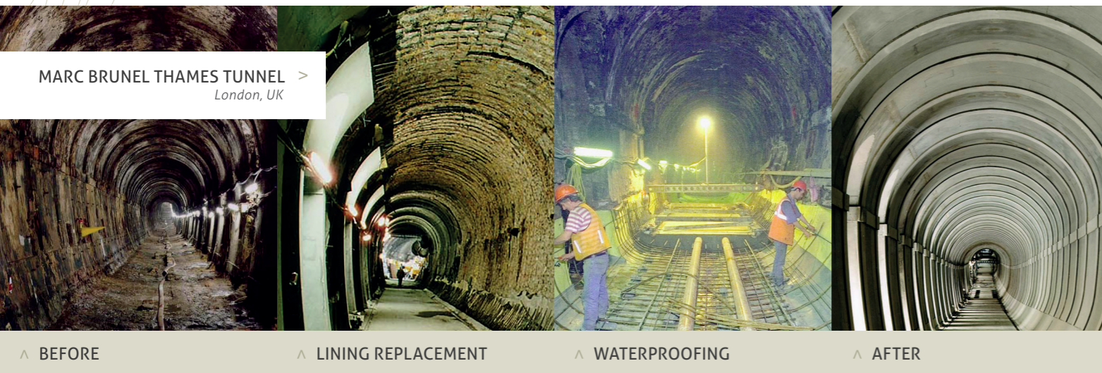
MARC BRUNEL THAMES TUNNEL > London, UK