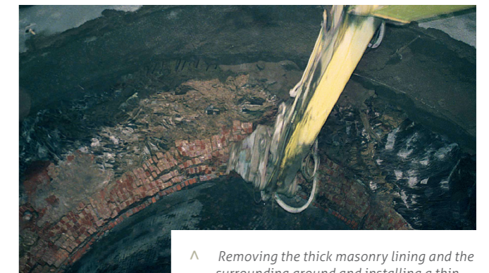
^ Removing the thick masonry lining and the surrounding ground and installing a thin shotcrete shell.

Installing an overhead catenary system for traction power supply or providing for the operation of twin-deck rail cars to raise passenger capacity in an existing tunnel usually requires increasing the clearance envelope of that tunnel. This involves removing the tunnel lining and, as required, the surrounding ground to the desired profile and installing a shotcrete support system. A flexible waterproofing membrane is installed against the primary shotcrete lining and then a secondary, permanent concrete lining is constructed. Our rehabilitation concepts ensure the durability and serviceability of the tunnel and of the installed utilities and facilities.