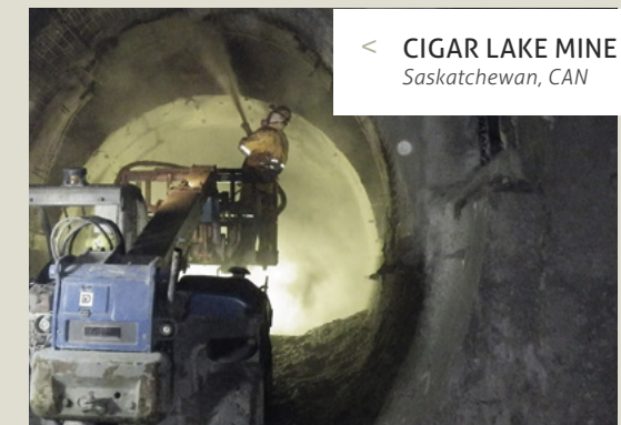
< CIGAR LAKE MINE Saskatchewan, CAN

The CIGAR LAKE MINE boasts the world's second-largest high-grade uranium deposit and is considered one of the world's most technically challenging uranium deposits to mine. It features a flat-lying ore body with highly altered ground above and below and 450 meters of water head. The ore body and surrounding ground has to be bulk frozen prior to extracting the ore with high-pressure water jets.