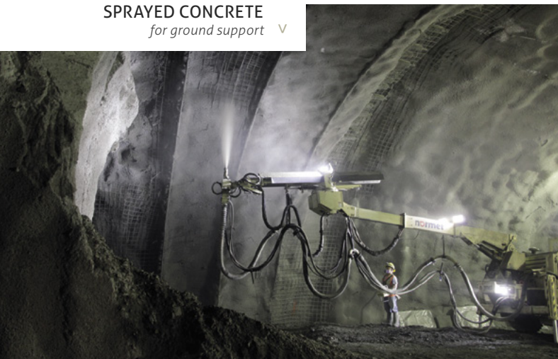
SPRAYED CONCRETE for ground support