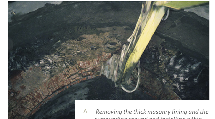
▲ Removing the thick masonry lining and the surrounding ground and installing a thin shotcrete shell.

Installing an overhead catenary system for traction power supply or providing for the operation of twin-deck rail cars to raise passenger capacity in an existing tunnel usually requires increasing the clearance envelope of that tunnel. This involves removing the tunnel lining and, as required, the surrounding ground to the desired profile and installing a shotcrete support system. A flexible waterproofing membrane is installed against the primary shotcrete lining and then a secondary, permanent concrete lining is constructed. Our rehabilitation concepts ensure the durability and serviceability of the tunnel and of the installed utilities and facilities.